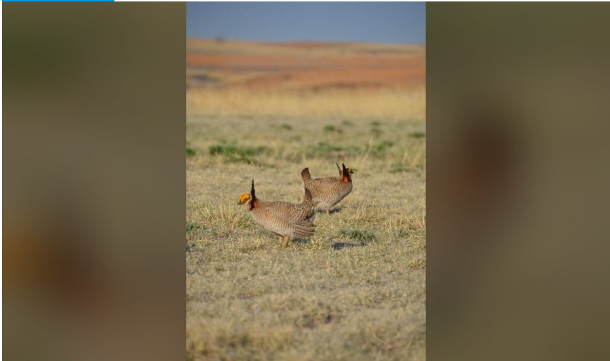
Lesser prairie chickens are photographed on western Oklahoma grasslands.